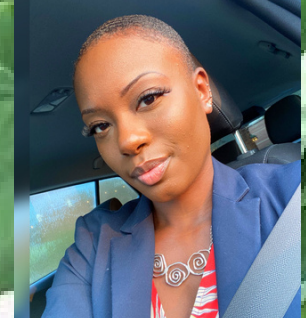
Public Relations Officer