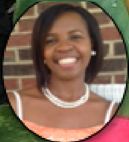
Asst. Secretary/ Treasurer